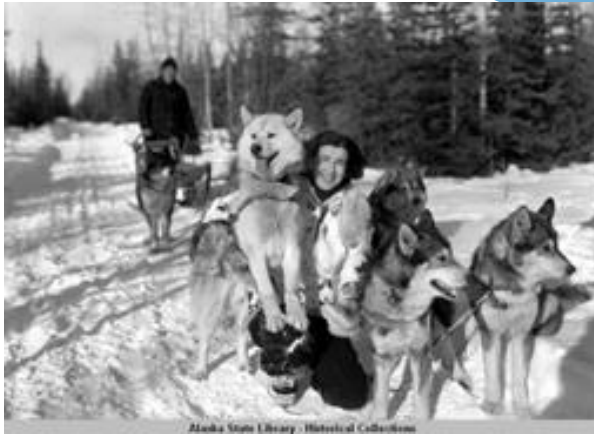
Alaska State Library - Historical Collections