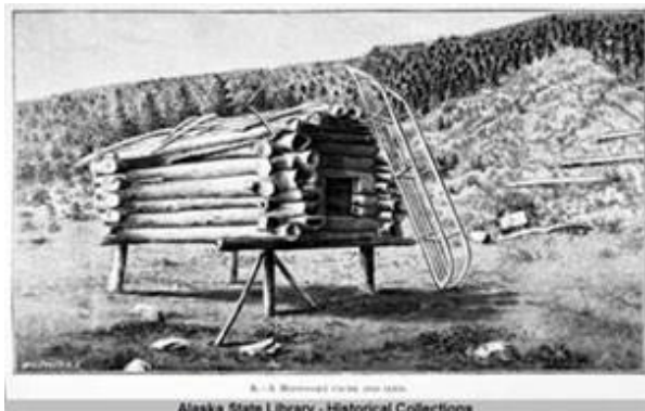
Alaska State Library - Historical Collections

Historical photographs, albums, oral histories, movies, maps, and documents from libraries, museums and archives across Alaska.